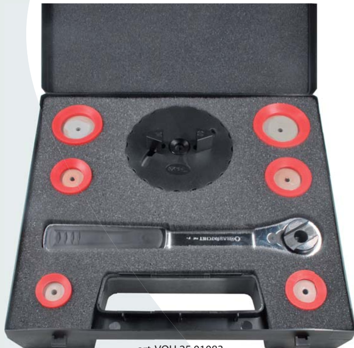
art. VOH 25.01083

Screwing and unscrewing watchcase backs with suction cups and ratchet wrench